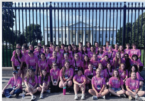
54 students from Illinois stop to pose for a picture outside of the White House.