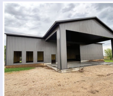
Their winemaking has grown from basement, to garage, and soon into a new spacious building currently under construction.

Thanks for riding along. I'll see you down the road!