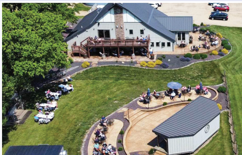
Arpeggio offers plenty of space for weddings, corporate functions, family reunions, or any group looking for a nice casual place to relax with friends.

Today, Arpeggio produces 16 different wines — all crafted in a converted two-car garage that serves as the heart of production. As demand has grown, so has the need for space.