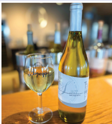
Each variety of wine has a musical term in its name.

"Musical tastes" Continued from page 18C fairs, and the popular anniversary celebration, "Red, Wine, & Blue."