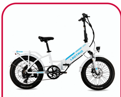
Win this eBike!

For over 70 years, the Farm Progress Show has celebrated agriculture by bringing tradition and businesses together from all over. It is where people come to gather, meet, observe, and learn. Major manufacturers roll out their newest offerings, and it is the best place to see what is in the future for agriculture. The show rotates annually between Decatur, Illinois, and Boone, Iowa. Hope to see you August 26, 27, and 28.