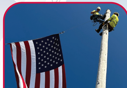
Watch linemen climb a 60-foot utility pole!

Stop by the booth and register for a chance to win a Lectric electric bike and climb in a bucket for a photo-op. Cooperative members who present their Co-op Connections card or show the Co-op Connections app on their device will receive a special gift. Weather permitting, the Touchstone Energy Hot Air Balloon will be flying the American flag the first two mornings of the show.