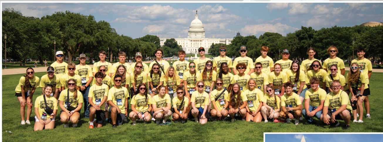
48 students from across Illinois stop to pose for a picture outside of the United States Capitol.