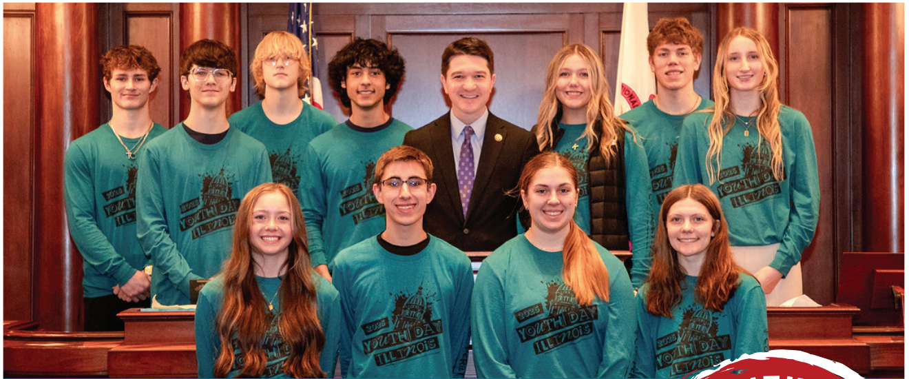
The 2025 Youth Day students were able to meet and talk with Senator Steve McClure during their time at the State Capitol.

A Shelby Electric Cooperative publication • www.shelbyelectric.coop