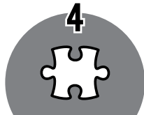
AUTONOMY AND INDEPENDENCE