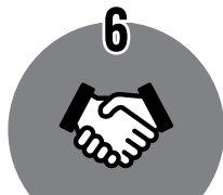
COOPERATION AMONG COOPERATIVES