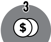
MEMBERS' ECONOMIC PARTICIPATION