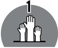
VOLUNTARY AND OPEN MEMBERSHIP

Cooperatives around the world operate according to the same set of core principles and values, adopted by the International Co-operative Alliance. These principles are a key reason why America's electric cooperatives operate differently from other electric utilities, putting the needs of our members first.