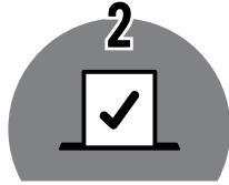
DEMOCRATIC MEMBER CONTROL