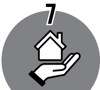
CONCERN FOR COMMUNITY