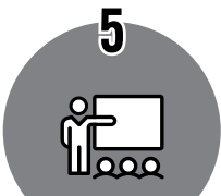
EDUCATION, TRAINING AND INFORMATION