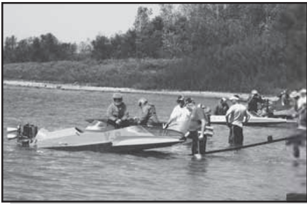
Balloons and Boats Coming To Lake Shelbyville see page 6