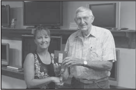
iPod Nano Winner Announced see page 2

A publication of Shelby Electric Cooperative