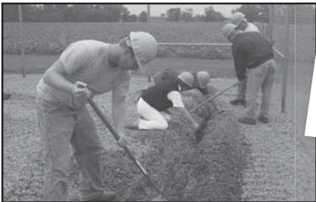
Cooperative Lowers The Boom see page 7