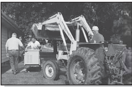
Shelby Energy Delivers First Generator see page 7