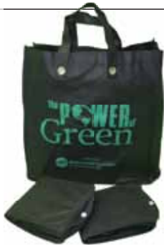
On July 14th at the East Route 16 location, Shelby Electric Cooperative will be giving away a Power of Green recycling bag to the first 150 cars in to recycle.

Come join us July 14th from 8:00 am to 12:00 pm to celebrate the Power of Green's 2nd Recycler Appreciation Day! "This program has continued to grow and has been successful from the very